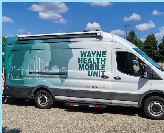
Wayne Health Mobile Unit

The Local Team visited the St. Christine Soup Kitchen and informed the members about the World Medical Relief Local Programs. The Team was able to inform the members about the World Medical Relief Affordable Prescriptions Program, durable medical equipment, and medical supplies available to low-income earners in the Metro-Detroit area.