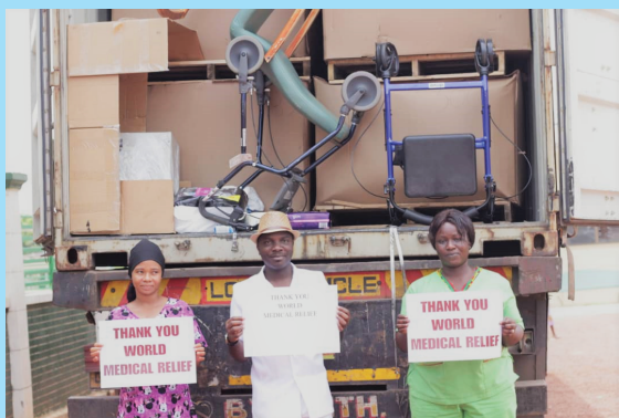
Recipients of Aid in Ghana