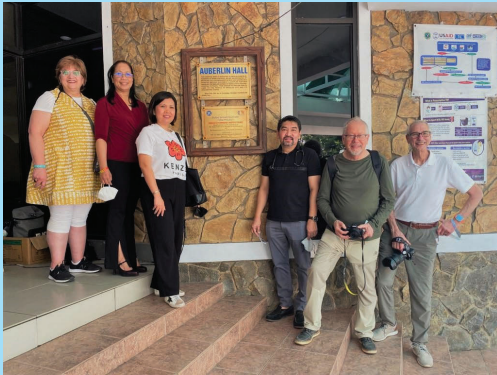
Auberlin Hall in the Philippines

In addition to the Turkey-Syria efforts, the International Team has been hard at work filling and shipping containers to countries in need. This year, we have shipped containers of medical equipment and supplies to medical facilities in Lebanon, Yemen, Uganda, Mali, and the Philippines. Below are pictures of the International development efforts. The International Team needs help to continue supporting the countries in need. Please visit worldmedicalrelief.org/donate to support the International Team.