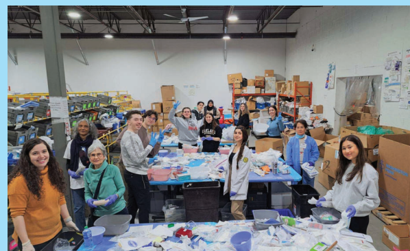
Volunteers and Students