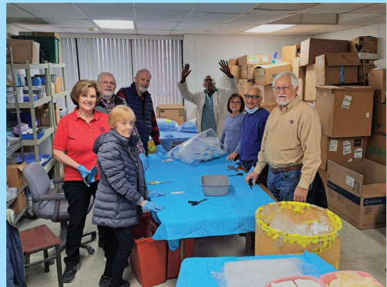
Troy Rotary Club