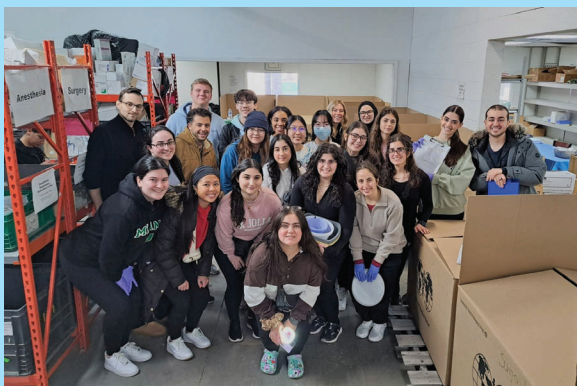
Oakland University Students