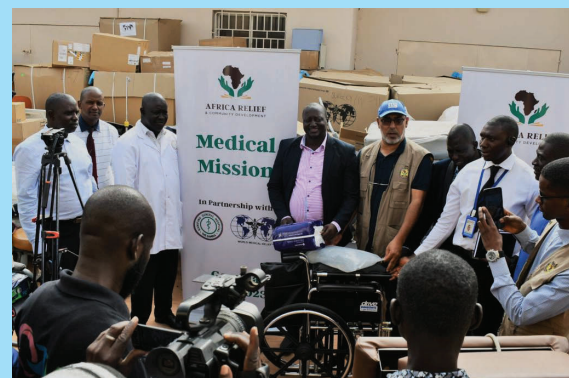
Africa Relief Medical Mission