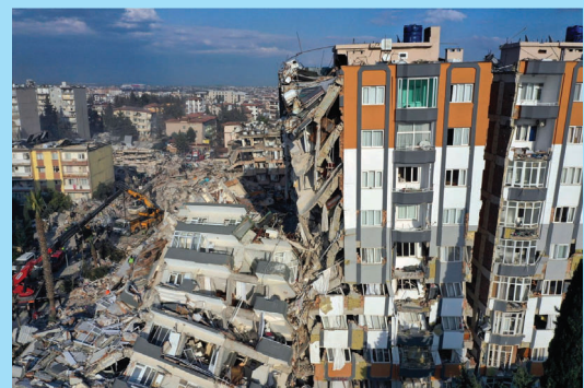
Buildings and Infrastructure Destroyed Because of the Earthquake