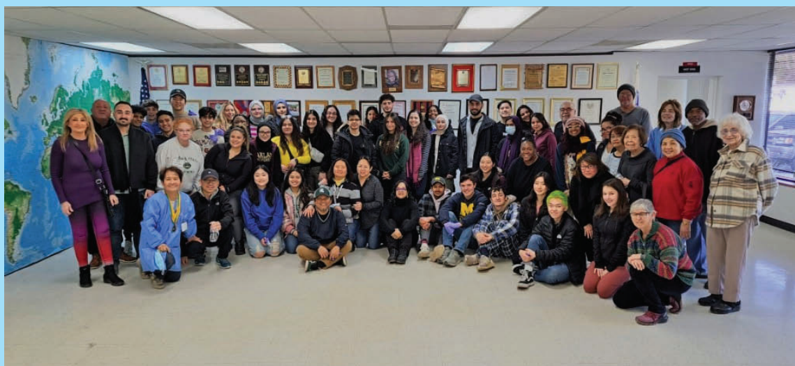
Volunteers Helping Immediately after the Earthquake

Serving the Sick & Poor Locally, Nationally, and Internationally Since 1953