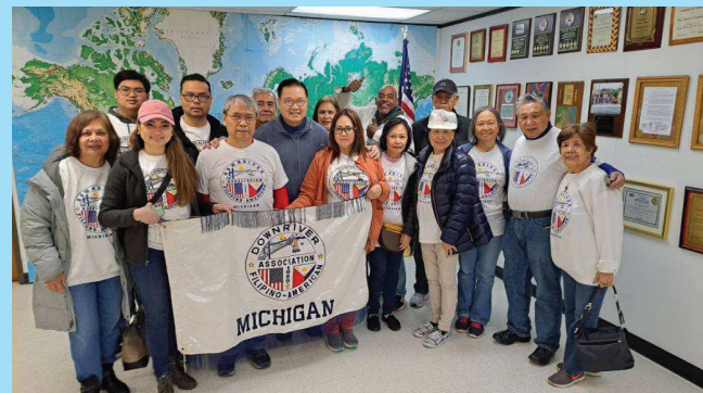
Downriver Filipino-American Association