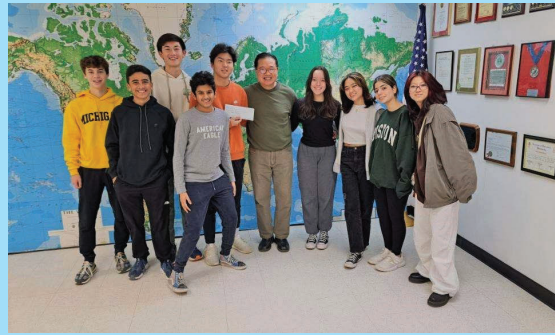
Seaholm High School