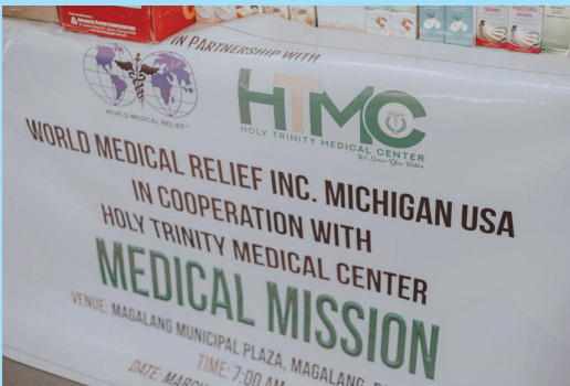
Philippines Mission Trip