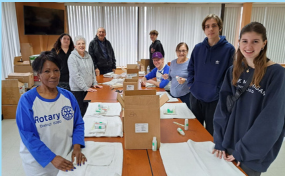
Troy Rotary Club