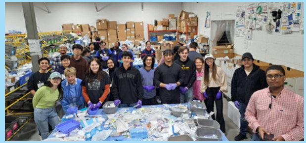
Volunteers need more space to sort

This began our dilemma – configuring the flow of receiving, packing, loading, and shipping in the most efficient way. Filled gaylords waiting to be loaded and shipped are lined up in places designated for unsorted supplies. This is especially difficult in the cold weather