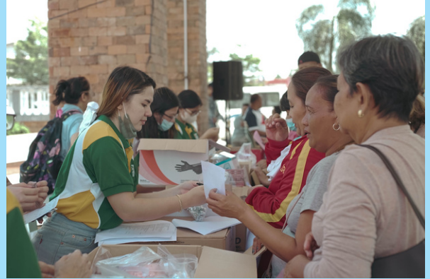
Medical Mission trip in the Philippines