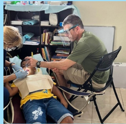
Medical mission trip in Santiago, Dominican Republic