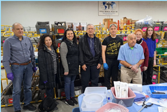
St. John Armenian Church