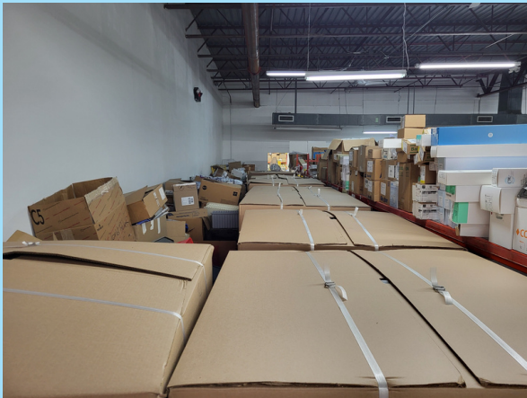
Gaylords aren't supposed to be in the sorting area! We need this space to efficiently process requests for aid.

How can you donate? Perhaps you or a friend knows