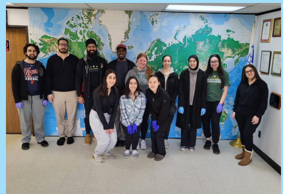
Wayne State University Students