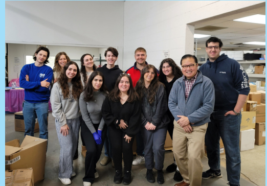
Oakland University Students