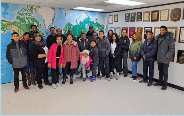
Tigray Community volunteers helping to prepare a shipment to Ethiopia

Despite the battles with the warehouse size constraints, the International Team has been hard at work filling and shipping containers to countries in need. This year, we have shipped containers of medical equipment and supplies to medical facilities in Lebanon, Ghana, Kenya, Gambia, and Senegal. In addition to the container shipments, the international team has also been providing equipment, supplies, and medicine for medical missions. More information is available at worldmedicalrelief.org/international-programs .