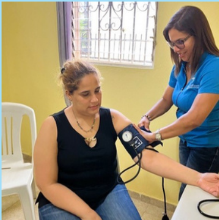
Medical mission trip in Santiago, Dominican Republic