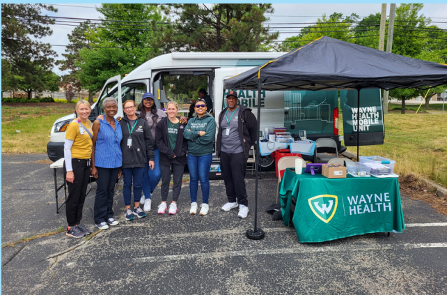
Wayne Health Mobile Unit helping at a World Medical Relief Community Health Fair

Our Affordable Prescriptions Program is still available for people who do not live in Oakland County. Visit worldmedicalrelief.org/local-programs for more information. If you have any questions, please do not hesitate to call us (313-866-5333) or email us ( GetHelpLocal@worldmedicalrelief.org ).