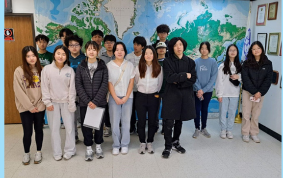
Korean American Cultural Center of Michigan