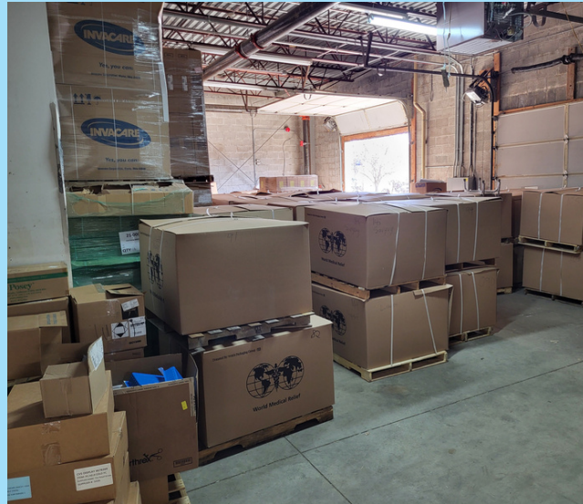
Photos of the World Medical Relief Warehouse: Product donations and gaylord packages have officially moved us to the brink of our capacity