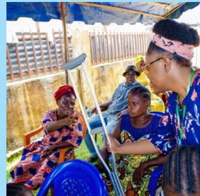
Medical mission trip in Brazzaville, Congo