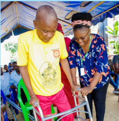
Medical mission trip in Brazzaville, Congo