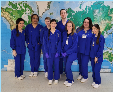
Chamberlain Nursing Students