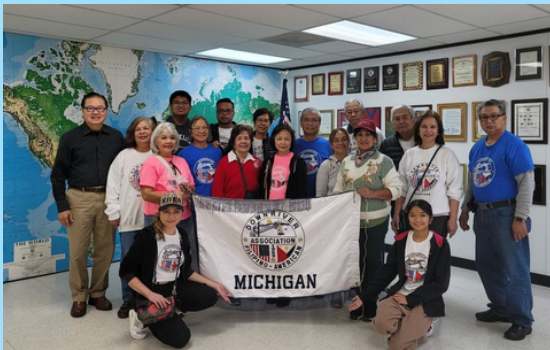
Downriver Filipino-American Association