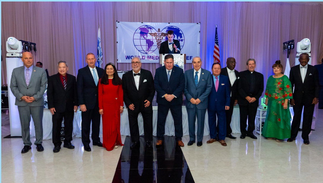
World Medical Relief Board of Directors receiving Volunteer Excellence Certificates at the 70th Anniversary Gala

Serving the Sick and Poor, Locally, Nationally, and Internationally since 1953