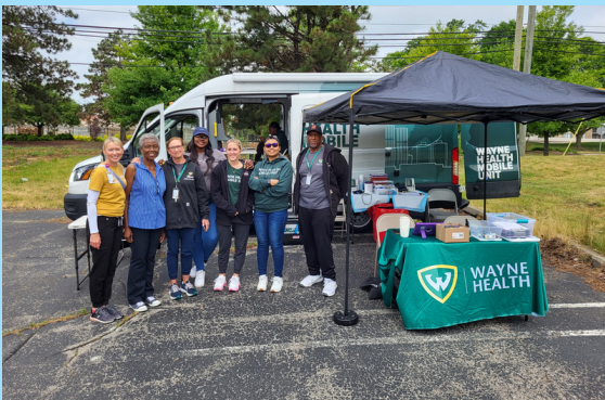
Wayne Health Mobile Unit helping at a World Medical Relief Community Health Fair

We will be launching the "Oakland County Affordable Prescriptions" program in 2024. The program will be providing affordable prescriptions to low-income, uninsured, and underinsured people in Oakland County. For more information about the program, please visit worldmedicalrelief.org/local-programs .