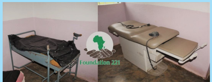
Before and after picture of a Medical Facility in Samanyana, Mali