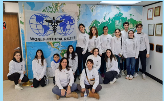
American Syrian Arab Cultural Association