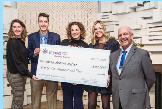
World Medical Relief winning the Impact100 Grant to provide Affordable Prescriptions

The Local Team needs help to continue supporting the local community in need. Please visit worldmedicalrelief.org/donate - or - scan the QR code to support the Local Team.