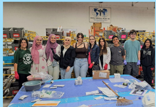
Wayne State University Students