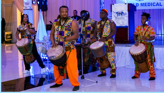
Nanou Djiapo Drum and Dance Group providing entertainment