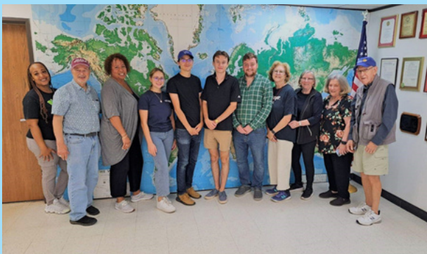
Detroit Rotary Club