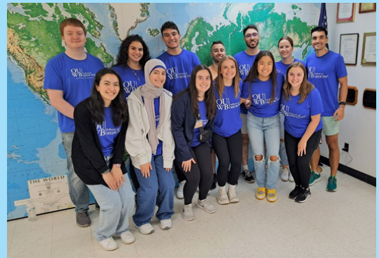
Oakland University Medical School Students