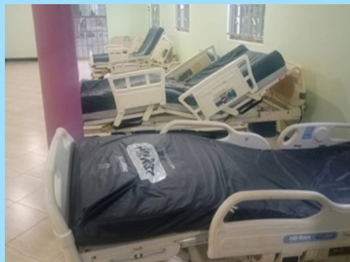
Medical Facility in Uganda who received a container shipment